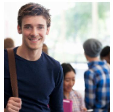
WHS Quiz Bowl