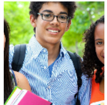
Latino Student Union