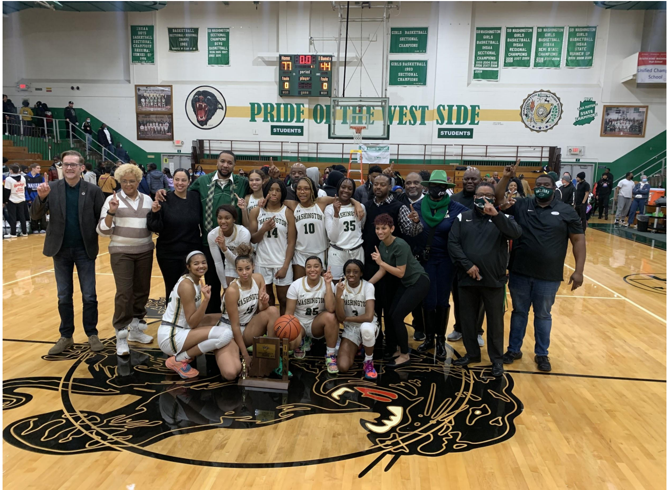
Congratulations Washington HS Lady Panthers! IHSAA Sectional Champions