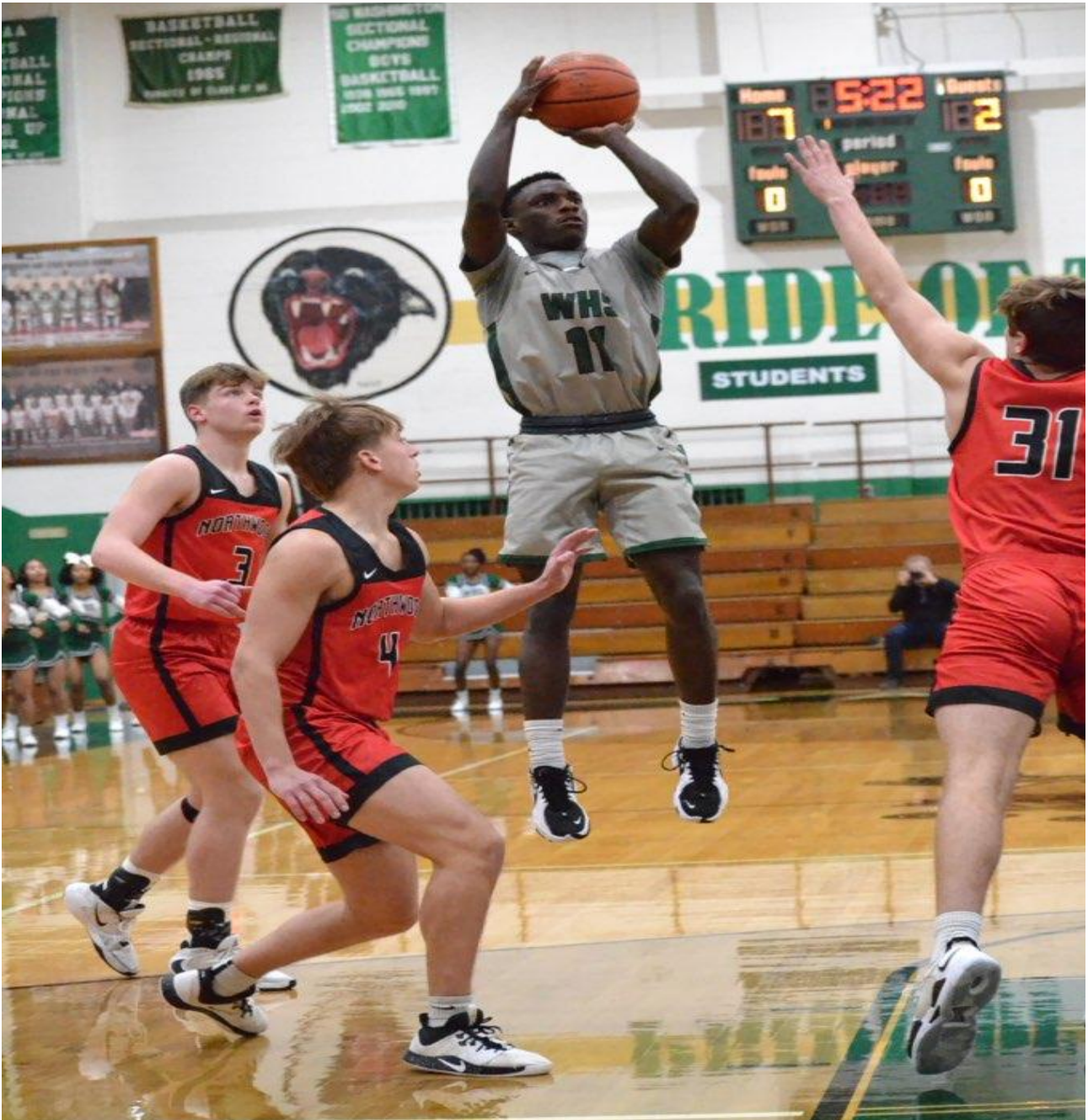
Congratulations to Washington High Schools Boys Basketball team who beat the #1 team in the state of Indiana. Outstanding job!