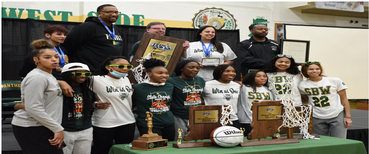
SB Mayor Celebrates with WGS GBB Team State Championship!

HAVE A WONDERFUL DAY AT BEAUTIFUL WASHINGTON!