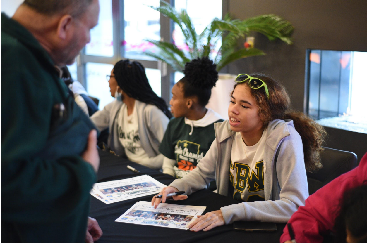
The Loft GBB Team Signing